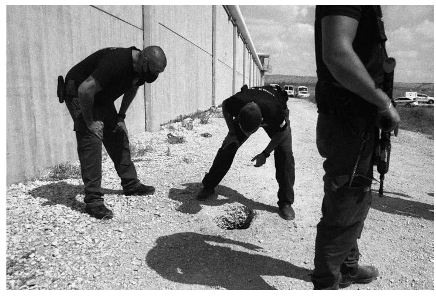
Security gaurds examine the presumed exit of the "freedom tunnel."