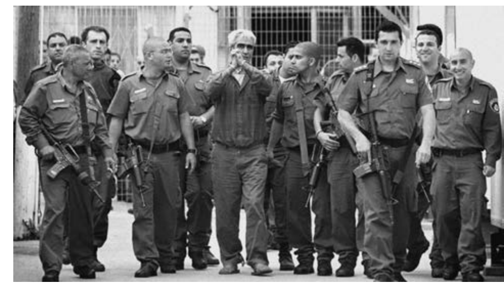
Manacled by occupation forces, an unbowed Sa'adat declared: "I am fighting occupation!"

and transform the prisons into museums of liberation. Revolutionaries across the world struggle and dream for this future, in every movement of oppressed people. Indeed, when we speak of the prisoners' movement, we are in essence speaking of Resistance.