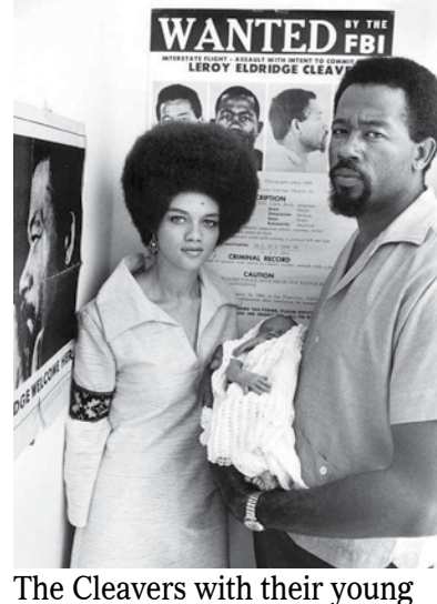
child in Algeria.

In this dire hour all the reactionary and criminal political conspirators in sors and the Hussein reactionaries the hire of US imperialism have openly combined their forces to stamp out rialist aggressors to drown in blood