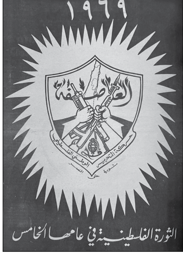
The emblem of Fatah's armed brigade Al-'Asifah ("The Storm"). The bottom text reads "The Palestinian revolution in its fifth year."