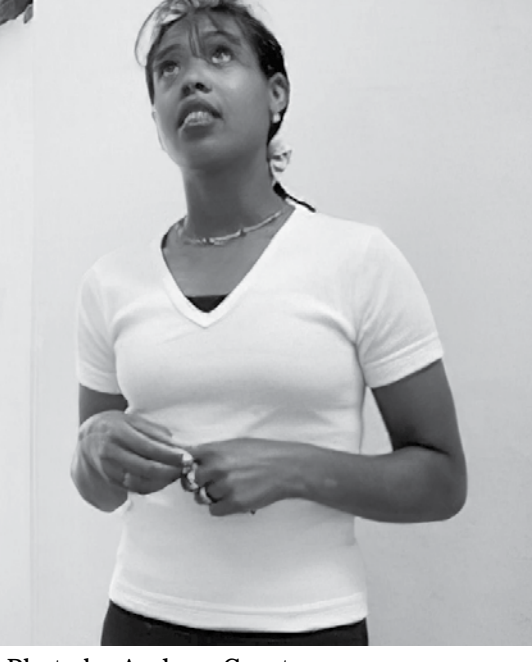
An Afro-Palestinian woman in her garden in Jerusalem.

dispossessed, the wake that trails the transatlantic slave ship is the ongoing, fluid process of immiseration that animates the afterlife of slavery. When assessing the failures of Reconstruction, histories that privilege the story of voter's rights over the story of land redistribution may miss the material fact that for Black Americans, Juneteenth cannot be separated from our collective relationship to the land.