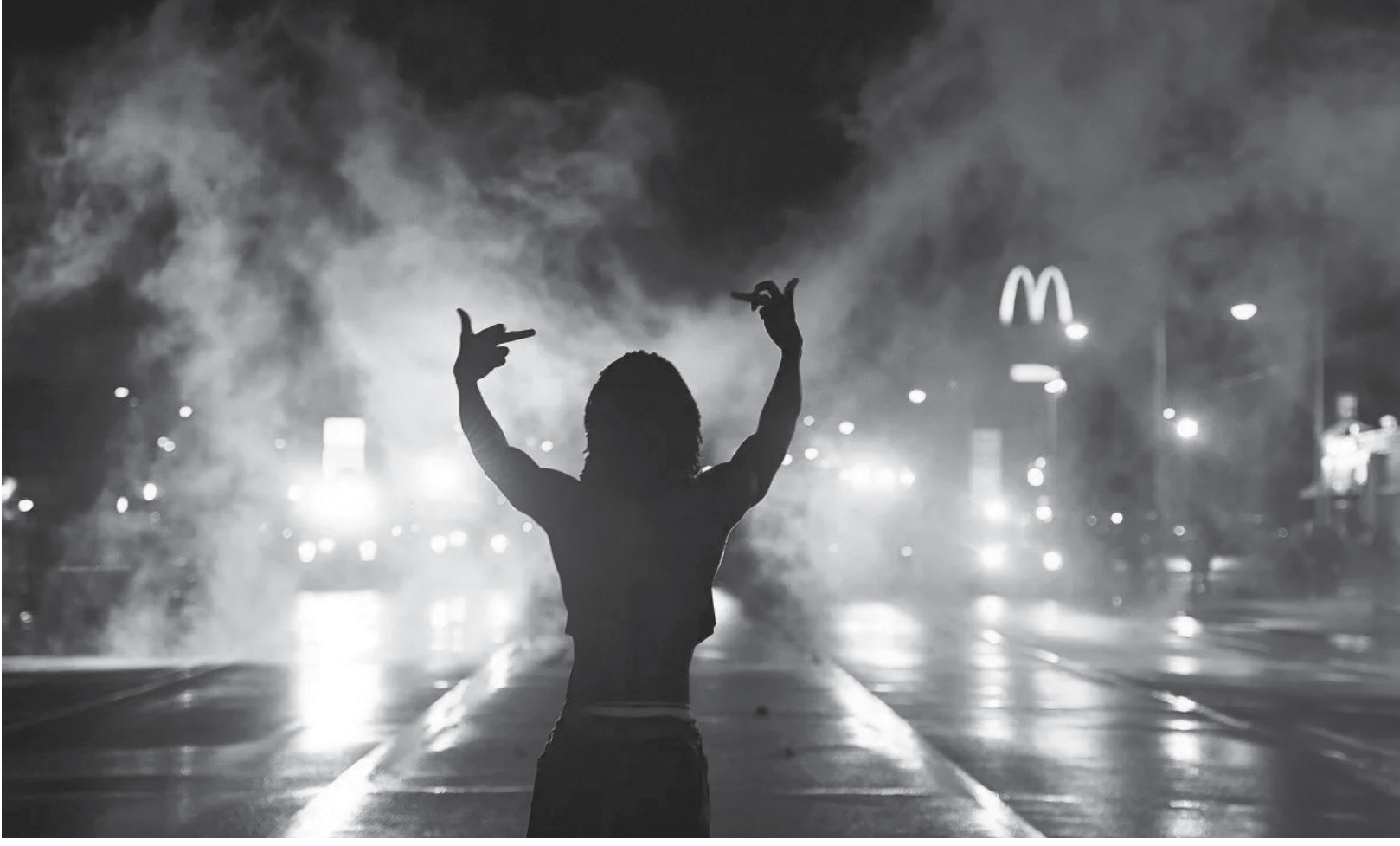
A protester flips off the cops during the Ferguson uprisings in 2014, the events of which still echo in the movement for a Free Palestine.

help stop US-sanctioned Israeli violence. The point is to make as much space as possible for Palestinians to fight for their own liberation.