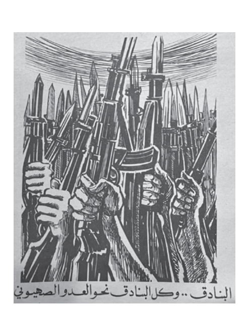
"The rifles...and all the rifles pointed at the Zionist enemy."