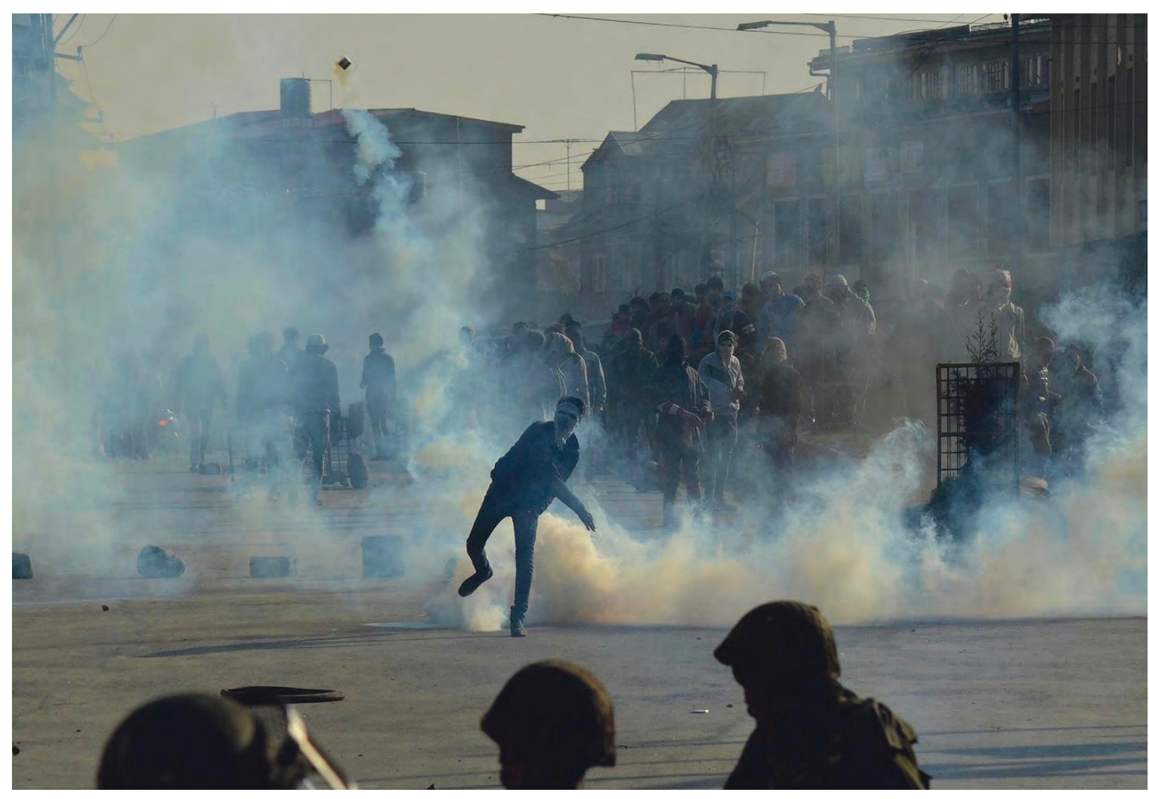
Protestors throw rocks at Indian authorities during a 2016 uprising in Srinagar.